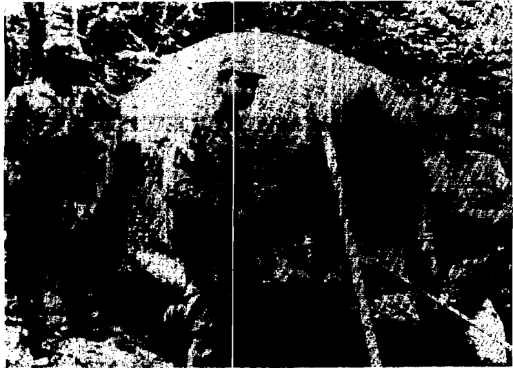
Oven found at original guerrilla campsite at Nacahuasu.